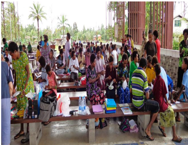
Making music resources Popondetta Cathedral