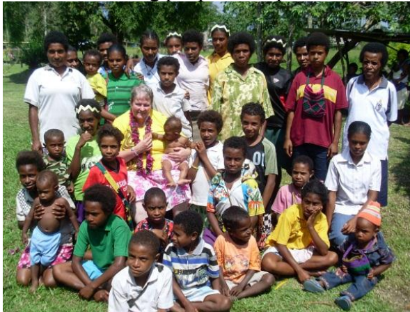
Young people at Gorari