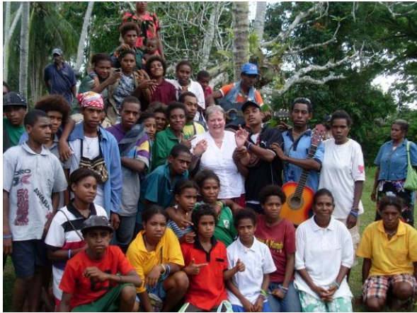
Young people at Popendetta