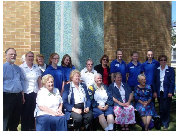
Newcastle & Sydney