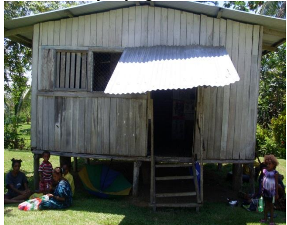
Health Centre Eiwo