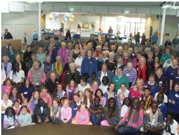
Ballarat Melbourne Bendigo