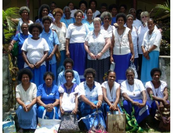
M.U. and Clergy Wivies Port Moresby