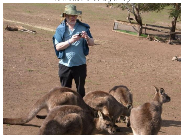
David's new flock?