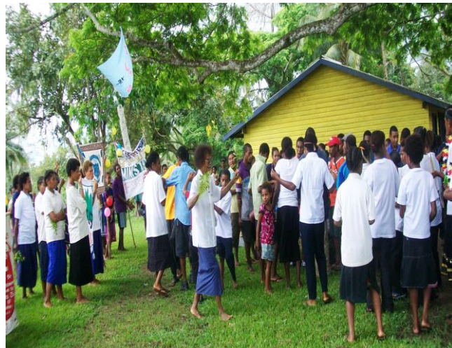
Getting ready for the parade of teams for the volleyball tournament