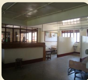
Admission and Assessment area