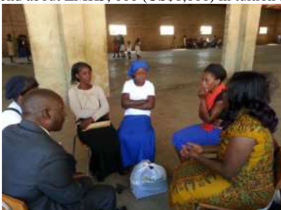
The GFS President briefing the GFS sponsored students

Finally the GFS pledge to train two ladies from Misolo where they travelled in September, 2012 with the evangelical team became a reality when two ladies reported for training. The GFS will spend about ZMK5, 000 (US$1,000) in tuition and other requirements to complete the course.