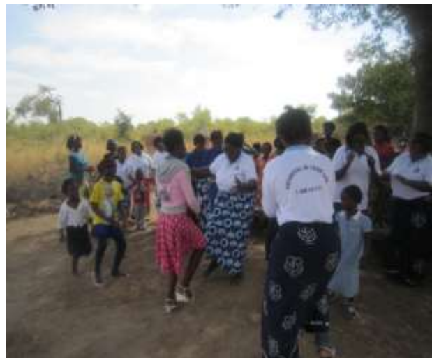
Fun time Leaders dancing with the members