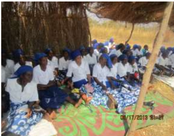
Part of the St Veronica members listening to the conference Proceedings

The Girls Friendly Society was invited by the St Veronica to partner with them to find ways on how to assist the rural women to be self reliant. To this effect The GFS National President, the National Treasurer was on hand to check how best GFS can come in and work with the rural women, we attended a very success St Veronica Conference in Sinjela in Lusaka rural about 80Km from Lusaka the Capital city. St Veronica has appreciated the work of the Girls Friendly Society, when two of their members who are also Leaders in the Girls Friendly Society were identified and have been sponsored to undergo a Tailoring Course as Trainers and will be able to train others in the village when they complete in December, 2013.