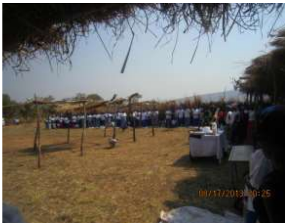
Part of the other group during a church service & a make shift altar