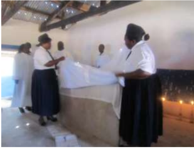
The GFS President addressing the congregation before the altar