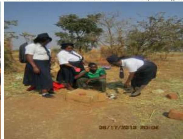
A Young man took advantage of the conference to cash in to have our phones charged he brought a generator (No electricity)