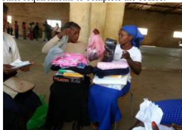
The students receiving the materials for their training