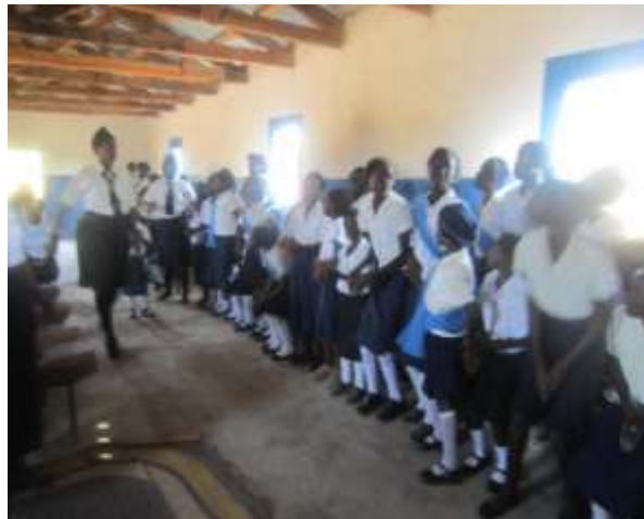
The GFS members ready to be enrolled as GFS members