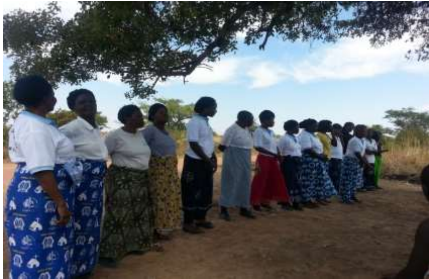
The GFS members who travelled to Masonsa to introduce GFS doing self introduction

The GFS through their tailoring project again dressed the altar and the Priests' uniform as the church could not afford to buy them; the place is in the remote their Sunday collection in church ranges from US$4.00 to US$5 (ZMK20.00).