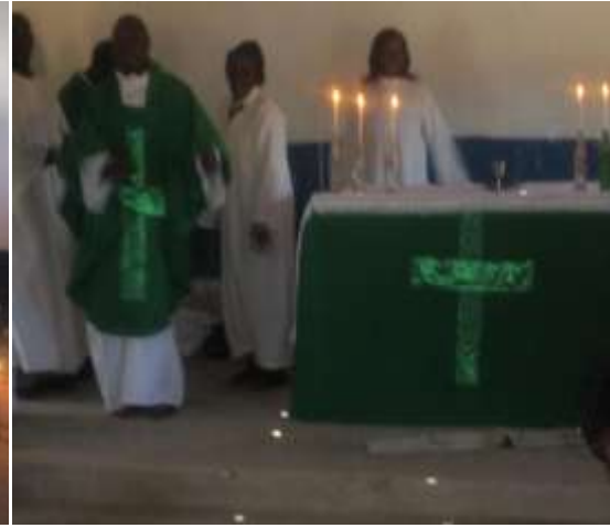
The Priest and altar well dresses were dressed with materials donated by GFS.