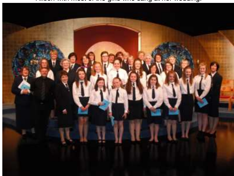
The group involved in the broadcast Service in the Studios afterwards.