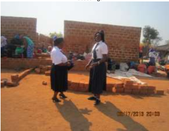
A church being built to replace the shelter the challenge is Money to have it completed