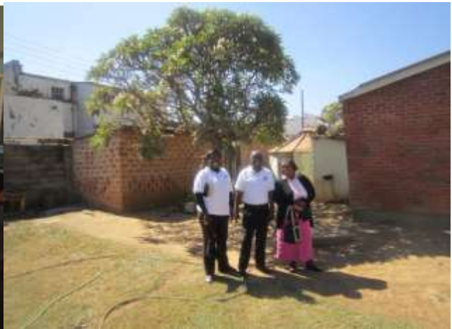
The GFS National President, Training Officer and the Treasurer after the meeting behind the GFS chicken Run