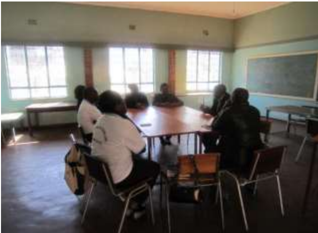
GFS members and Church council members during the meeting