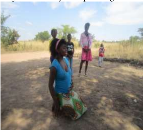
Performing a sketch appealing for help against early marriages

The GFS Executive Committee also felt that it imperative that two ladies are identified to do a tailoring course as way of empowering women who will in turn come and train others.