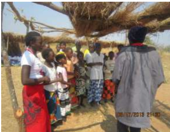
The church choir the girls and women earmarked to be enrolled in the GFS.