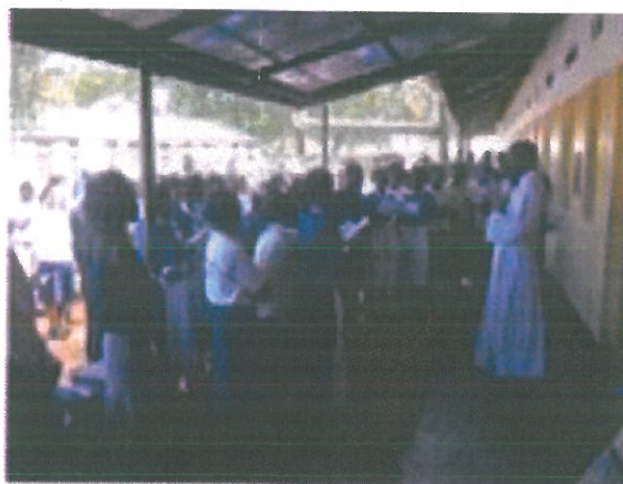
Commissioning the new male ward

The new male ward was finished, commissioned and opened for use in early September. We thank God for all those who used their skills to improve the building and the funding provided to enable this to take place. We appreciate the efforts of all the staff who worked hard to get the project finished. The building has the capacity for 32 beds and is also being used by the T.B. department.