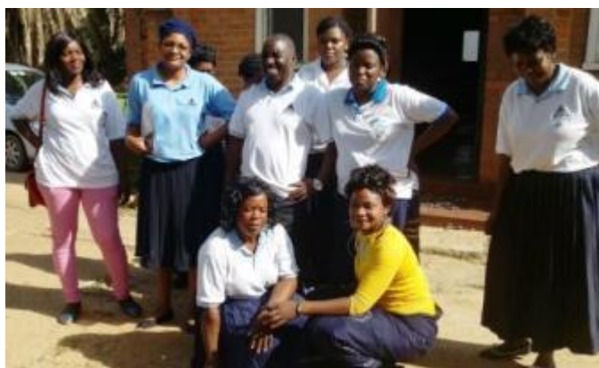
Some of the Executive members

The GFS – Zambia activities started this year by GFS members attending an All Church groups opening service that was held at St Peter’s Anglican Church on 24 th January, 2015 followed by a National GFS Executive Committee Member’s meeting in Kabwe at St George’s Anglican Church.