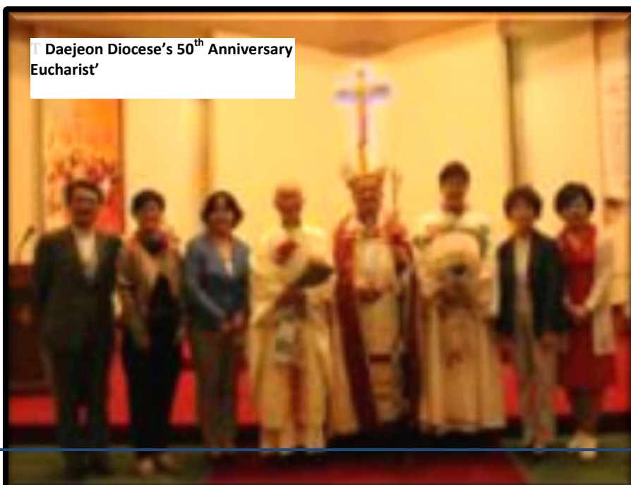
Daejeon Diocese's 50 th Anniversary Eucharist'

In July, we ran 'GFS Playschool 2015', a summer programme, two days a week at the Seoul Seobu Hana Centre, affiliated to Gayang 7 Social Welfare