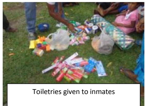
Toiletries given to inmates

This was then followed by another hour given to serve lunch for the inmates. However, this next hour of outdoor fellowship took the Melanesian approach which turned out to be a real great feast between both parties. Every GFS member had to serve whatever she cooked and brought for the inmates' lunch. The lunch was served and shared between