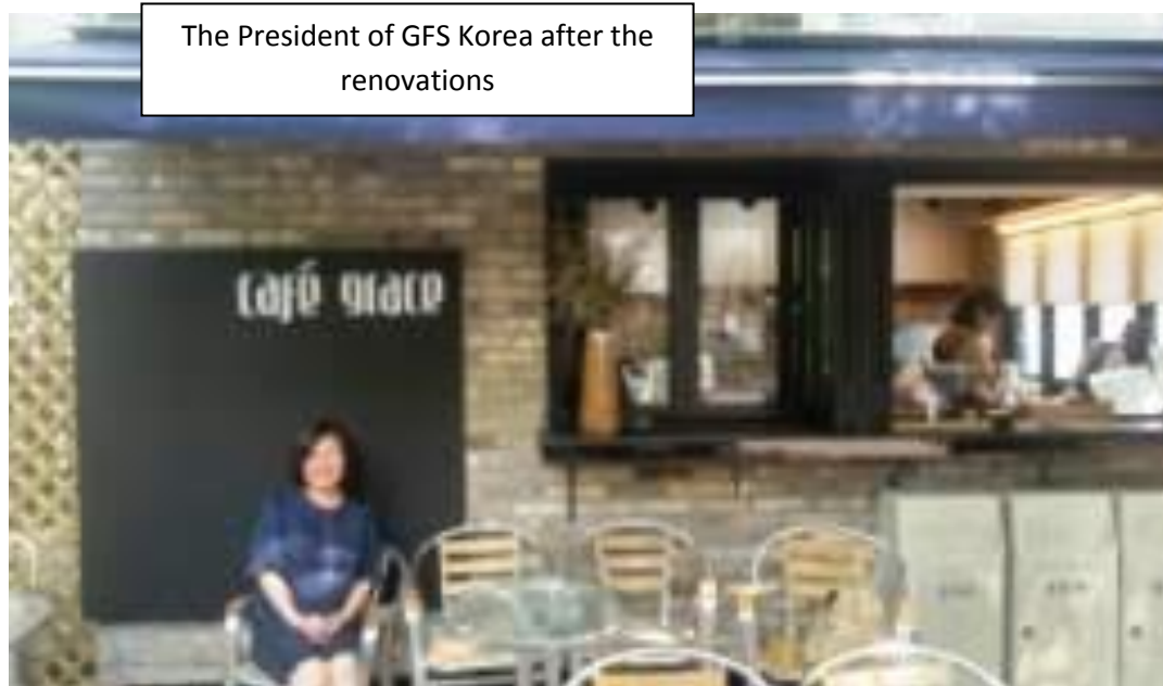
The President of GFS Korea after the renovations

Café Grace was renovated in June and finally settled into a new site. Due to demolition of National Tax Service (NTS) annex, the café's neighbouring building, café Grace was relocated a couple of times for its safety during the demolition process in the last two months. There will be a brief ceremony to celebrate