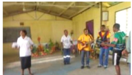
Male inmates taking part in the fellowship

The ministry focused first of all on an hour of praise and worship, the Ministry of the Word and the celebration of the Holy Communion for the Anglican inmates. Surprisingly not, an Anglican priest who also was serving in prison was the given the opportunity to lead the sing along in the church fellowship.