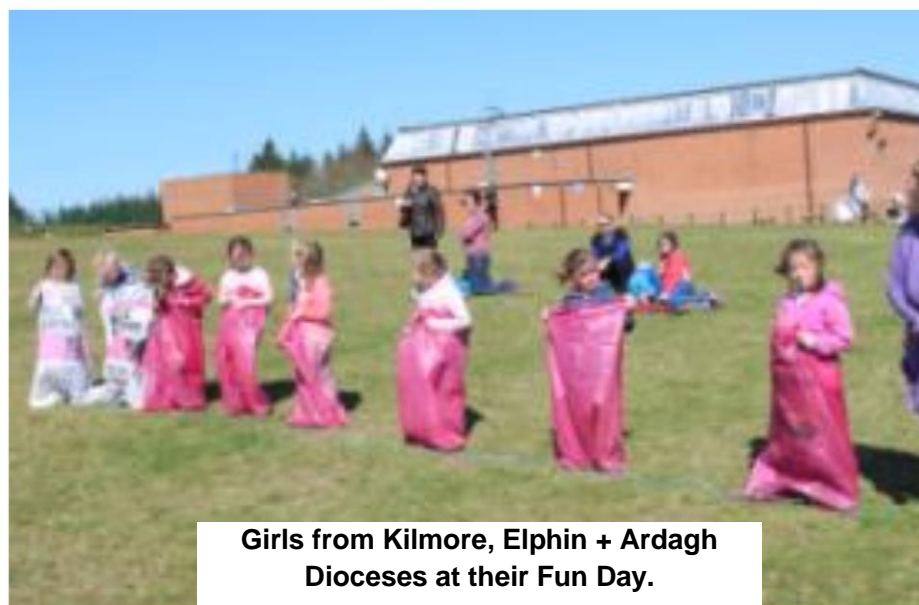
Girls from Kilmore, Elphin + Ardagh Dioceses at their Fun Day.

that we "please keep GFS strong for the future". Throughout her illness her faith sustained her and she was an inspiration to others. She is greatly missed but we trust that she is with the Saints, by that beautiful river that flows by the throne of God.