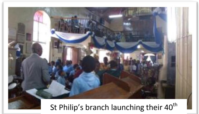
St Philip's branch launching their 40 th anniversary

Branches at their Thanksgiving Service 2015