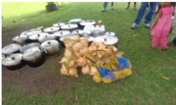
Nutritious food & nuts prepared for the Inmates lunch by GFSs members