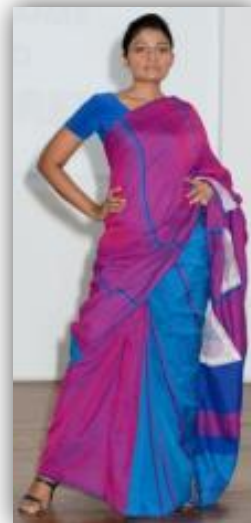
A Model at May Breeze