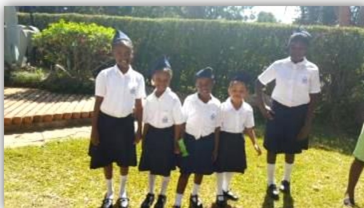
GFS girls Cathedral of at the Holy Nativity