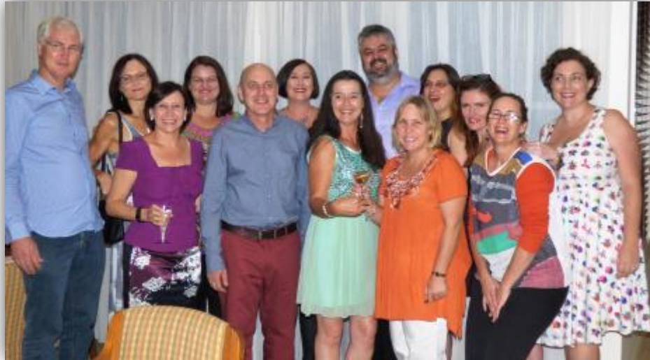
Some of the past members of GFS and CEBS