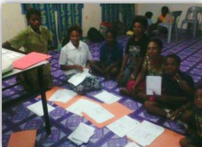
GFS leaders in training at GFS Haus