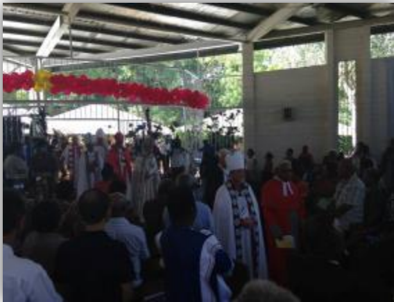
Procession into St Martin's Boroko