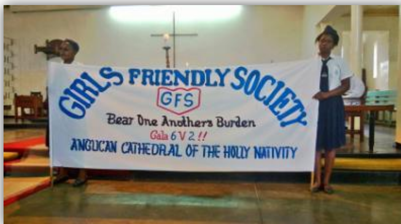
Girls Friendly Society – Banner