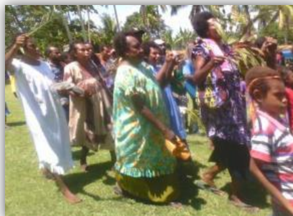
GFS leaders being welcomes at Eroro – Training Day