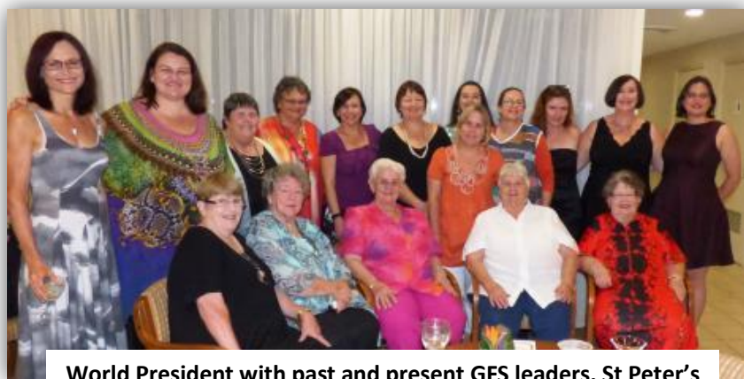
World President with past and present GFS leaders, St Peter's parish, Townsville, North Qld

leaders. Australia's constitution allows adult financial members so that our Townsend groups and other adult member's groups are fully covered by our insurance. These groups are open to male and female members and you will see an article in this newsletter where adults are playing an important role in a new GFS