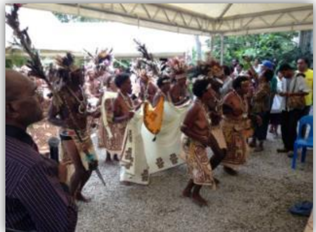
Bringing forward gifts and vestments