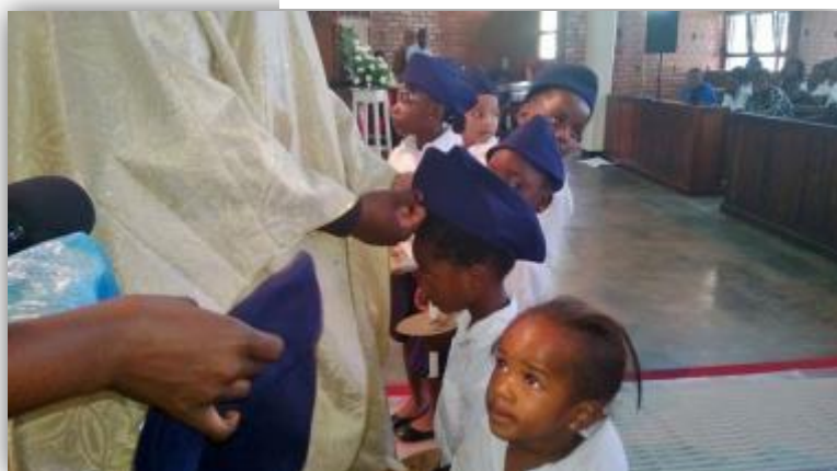
An enrolment at Cathedral of the Holy Nativity