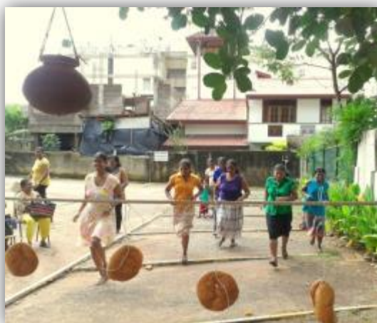
Avurudhu fun - See how they run! The bun eating race begins. Also note the pot hanging above.