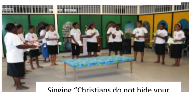
Singing "Christians do not hide your light"