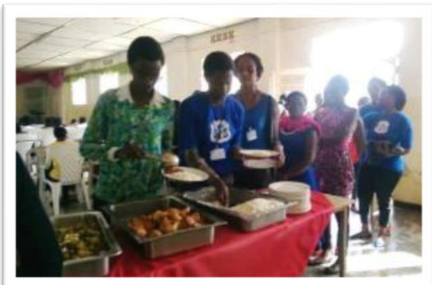
Had a lunch together and we shared it with mother's union