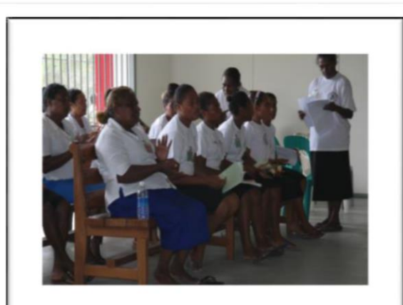
The coordinator & assistant giving out copies of chorus.