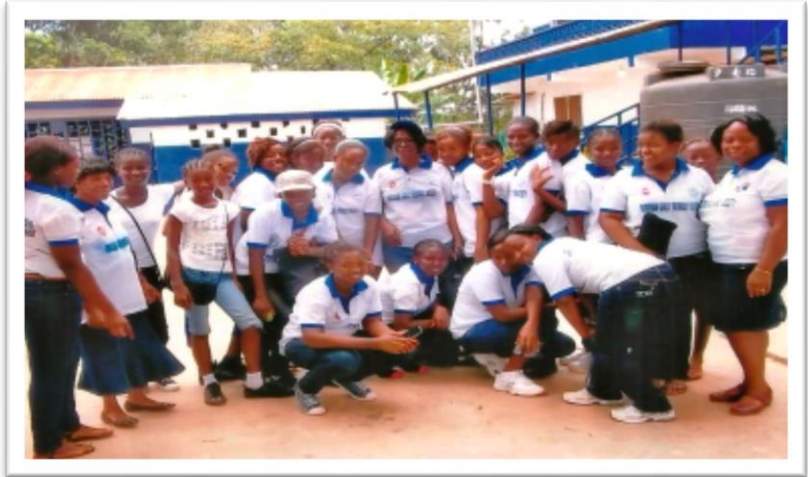
GFS visitation to James N. Davies Memorial Hospital