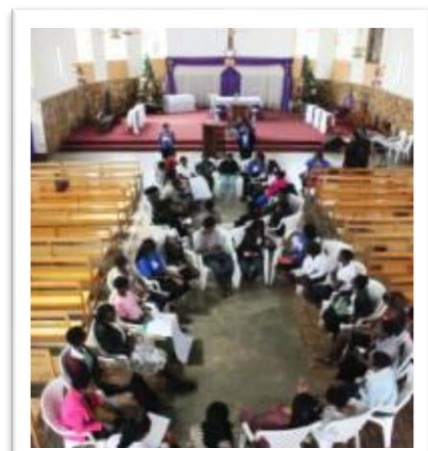
Participants during workshops

The GFS will seek to be a bridge between older Christian women and young girls in an attempt to protect them and proclaim the gospel to the next generation and provide support for young ladies in this rapidly growing society. Furthermore, GFS will also seek to build up young ladies spiritually, physically and emotionally through Bible studies, prayer gatherings, education trainings, outreach, and mentorship relationships on one hand. The GFS will also focus on improving their well being by development trainings, grouping them into savings and credits associations, Advocating for their education and trainings on income generating activities.