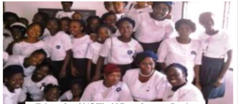
Taken after 2015 World Day of prayer Service

From December 27 – 30, 2015, the Girls attended a vacation camp during the Christmas break to enable them have a better understanding of the significance of Christmas. The camp was held at the home of one of the Branch Coordinators,