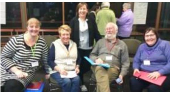
Friends spending valuable time together

National Park. We had time to catch up with each other, renew friendships and learn from one another. The presenters gave us wonderful food for thought & challenged us to think about how we could take our GFS