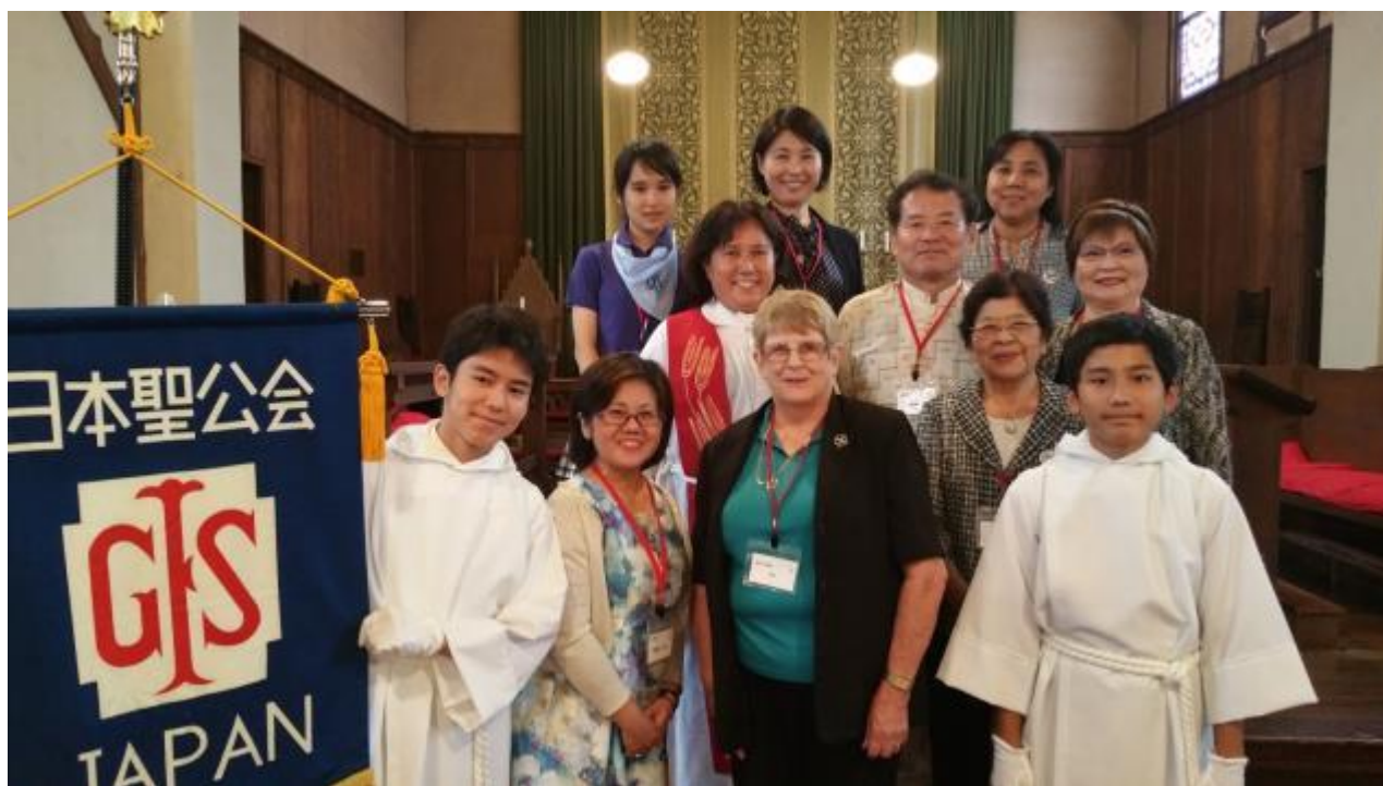
Val with Okinawa GFS members