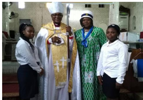
Two new members admitted at St. Michael and All Angels' Cathedral, Douala.