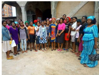
GFS Members at Victory Station New Bell –Douala during 2-Day Conference from 19 th – 20 th August 2017