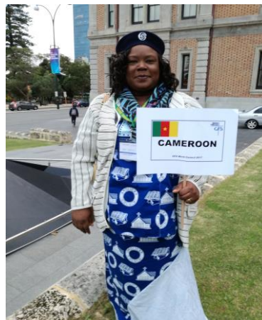
GFS Diocesan president @ GFS World Council

Greetings from Cameroon to the GFS family worldwide. GFS Cameroon is growing from strength to strength with its joy of having participated in the 2017 World Council in Australia. It has been three months of long vacation holiday in which lots of activities has been going on across the Diocese such as opening of new branches, admission of new members in different parishes, parish conferences with exciting activities for the girls.