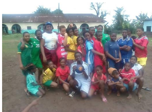
GFS members at St. Andrew's parish, Tiko pose after football match during their conference held from 18 th - 20 th August.