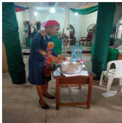
Practical class on Yoghurt-making