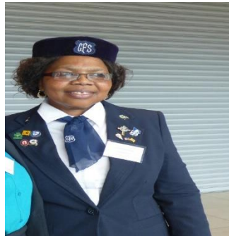
From the World President

Here is our word for today: Song of Solomon 2: 11